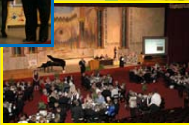
Scenes from KidTalk Celebration '08